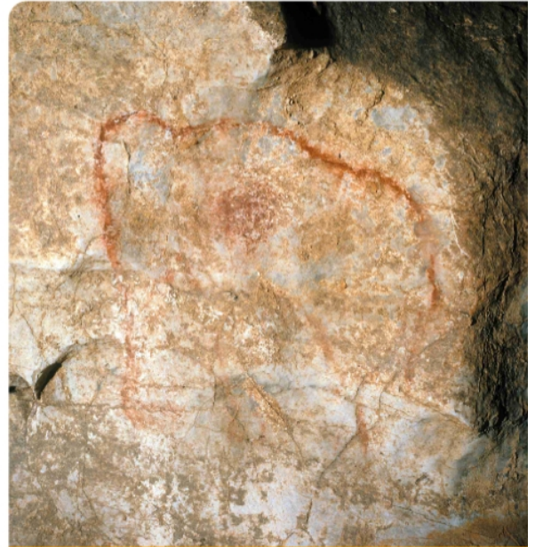
Mammoth ▲