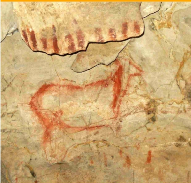
▲ Female deer

The northern side has three sections. About 200 m. from the cave entrance is the Main Panel which contains the largest number of the cave's paintings and engravings. This wall is about 10 metres in length and here we can see with varying degrees of clarity a series of red painted figures. There are six animal figures (three bison, a female deer and a mammoth) and a number of abstract shapes in ordered groups or distributed individually across the whole wall: traced lines and little